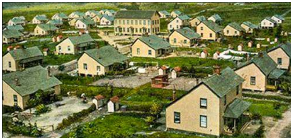
Orr Mill Village

"We had our own recreation programs with our own recreation director. We had our own baseball and basketball teams. We also had our own swimming pool. What we used