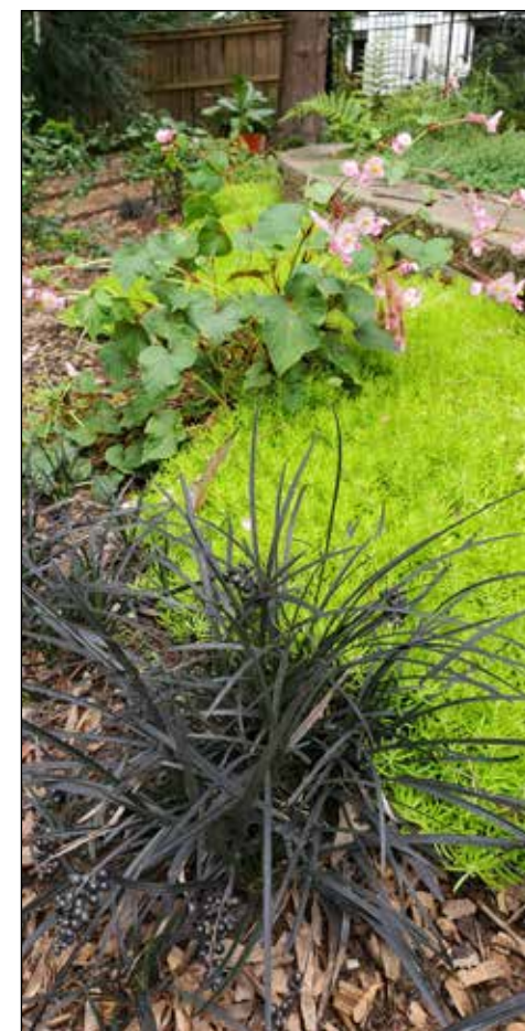
Sedum, mondo, and hardy begonia

Another garden had a spot of Angelina sedum ( Sedum rupestre 'Angelina' ) with black mondo grass and hardy begonia. I wouldn't have guessed black mondo grass and hardy begonia could grow well with Angelina. It sedum likes sun. The other two do not. I have a few hardy begonias growing on the backside of the breezeway. I haven't tried to encourage their growth but am going to start. At the sidewalk coming up the breezeway, there's a couple of black mondo grass clumps. They used to be in a container under the crabapple tree but I did away with those containers...too much to water. I planted the mondo in the ground. It hasn't grown much either. Angelina sedum is growing in a couple of pots so I'm going to move some of it with the black mondo, scatter some seeds from the hardy begonia, and see if I can get a patch started. I love the chartreuse color of Angelina in plants. The height of these plants will be nice along the sidewalk. I don't know how deer resistant hardy begonias are but if they seed themselves in the front garden, and deer will let them grow, that will be a good thing.